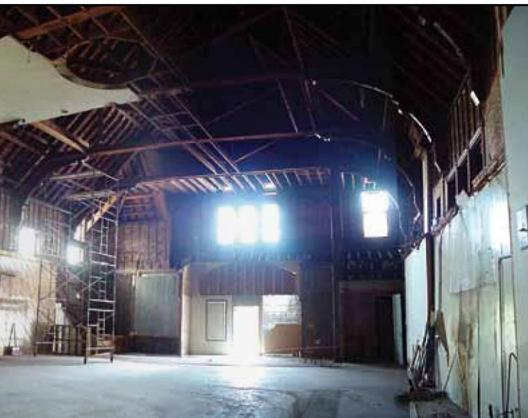
▶ After a $5.9 million historic rehabilitation, the 250-seat Town Hall Theater hosts plays, dances, wedding receptions, classes, exhibits, and even a very popular winter farmer's market.